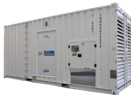
Silent / Closed Type