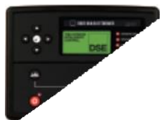
DSE7320 MKII AUTO START & AUTO MAINS